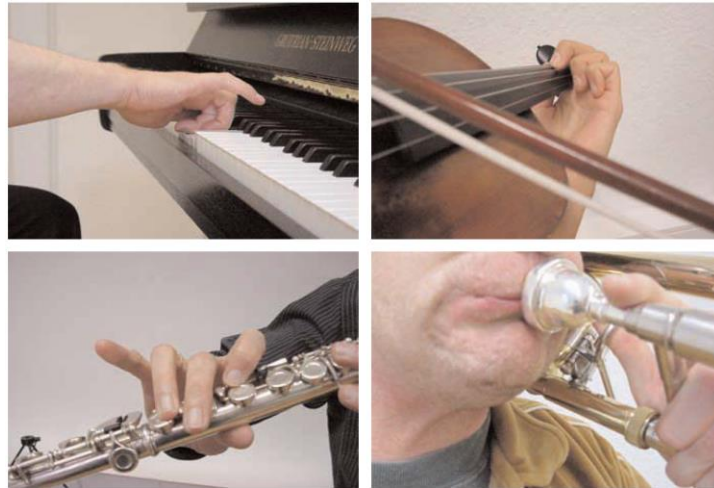
Figure 2.3. Typical patterns of dystonic posture in a pianist, violinist, flutist, and trombone player 89

resulting in a worsening of the condition. 84 Similarly, the results of recent research conclude that classical musicians are the most likely population to develop FTSD due to the continuous execution of complex repetitive movements over the course of many years. 85 FTSD's frequency of appearance in the general population is 1:3,400 86 while its rate in professional musicians is approximately 0.5%–8%. 87 Furthermore, studies have shown that between 8% to 14% of musicians visiting performing arts clinics are ultimately diagnosed with FTSD. 88